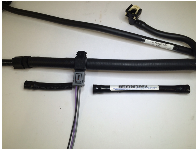
Completed repair example

STEP 11: Reconnect battery and test drive.